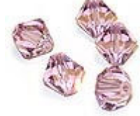
June - Alexandrite