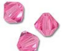
October - Rose