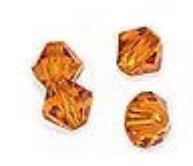
November - Topaz