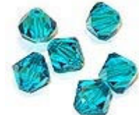
December - Zircon