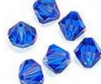
September - Sapphire