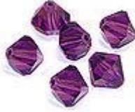
February - Amethyst