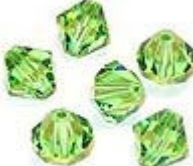
August - Peridot