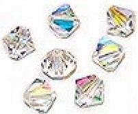
April - Diamond