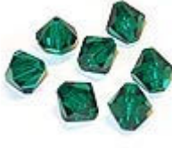
May - Emerald