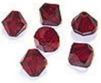
July - Ruby