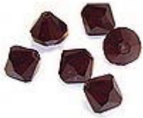
January - Garnet