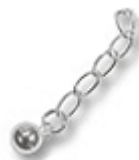
Extender with ball