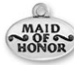
Maid of Honor