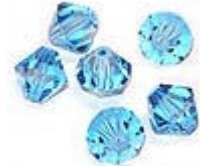
March - Aquamarine